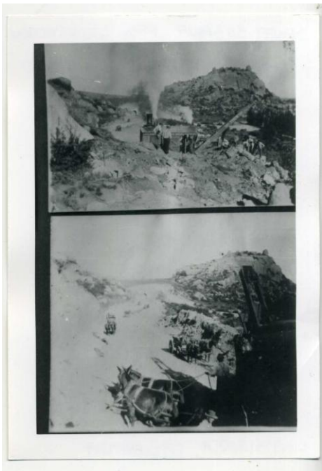
Original photo size above.

Photo on right shows teams of horses pulling equipment and wagons. Stoney Point is visible on the right. The photo below right shows equipment with a derrick moving rocks. The Santa Susana Pass Road (that still exists today) was built in 1917.